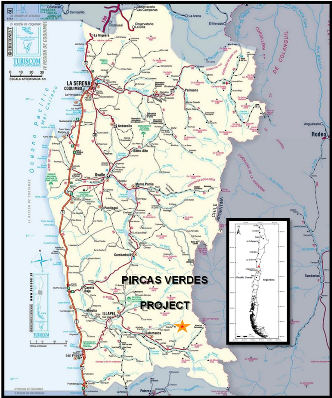
Figure 1: Location of the Pircas Verdes Project.