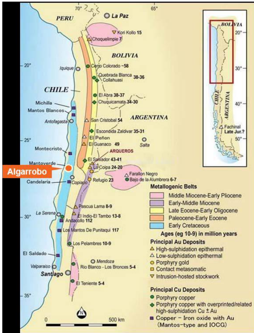
Figure 1: Location of the Algarrobo IOCG Project.